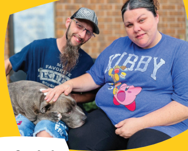
Case Study 1

Local charities supported so they can keep providing essential care and support