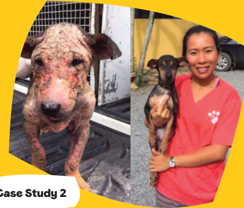
Case Study 2

Community Spay Neuter Initiative Partnership Michigan